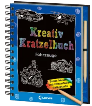
Creative Scratch Book - Vehicles Hardcover