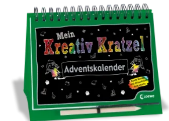
Creative Scratching: Advent Calendar Hardcover