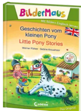
Picture Mouse English - Little Pony Stories Hardcover