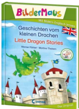
PictureMouse English - Little Dragon Stories Hardcover