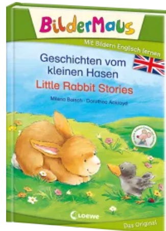
Picture Mouse English - Little Rabbit Stories Hardcover