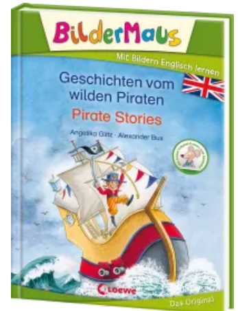
PictureMouse English - Pirate Stories Hardcover