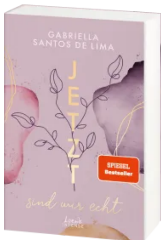
NOW (Vol. 1) - NOW We Are Real Paperback