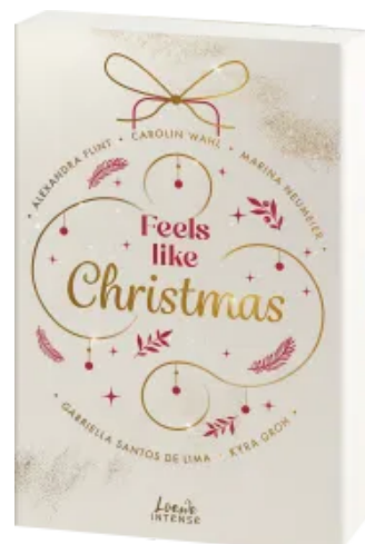
Feels Like Christmas Paperback