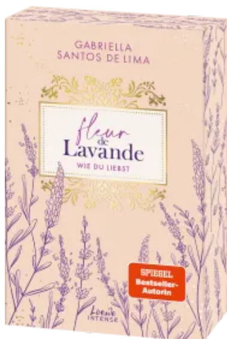
Fleur de Lavande (Vol. 1) The Way You Love Paperback