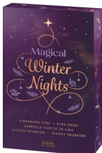
Magical Winter Nights Paperback