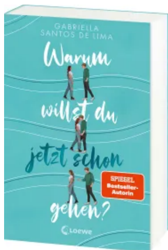
Why Do You Want to Leave Already? Paperback