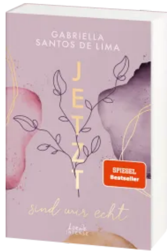
NOW (Vol. 1) - NOW We Are Real Paperback