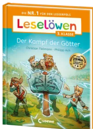
Reading Lions (Year 3) – The Battle of Gods Hardcover