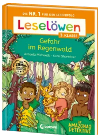
Reading Lions (Year 3) - Amazon Detectives: Danger in the Rainforest Hardcover