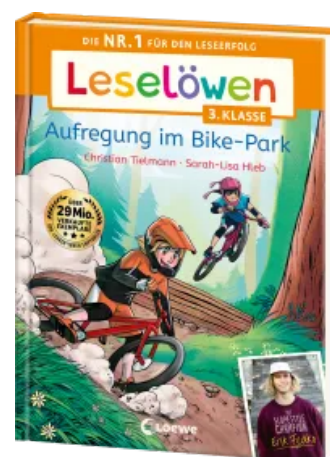
Reading Lions (Year 3) – Excitement In the Bike Park Hardcover