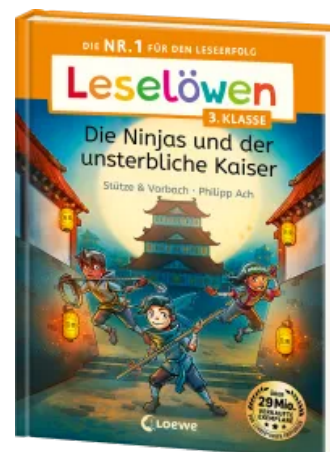
Reading Lions (Year 3) - The Ninjas and the Immortal Emperor Hardcover