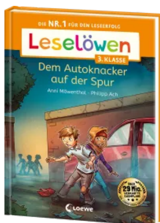
Reading Lions (Year 3) - On the Trail of the Car Burglar Hardcover