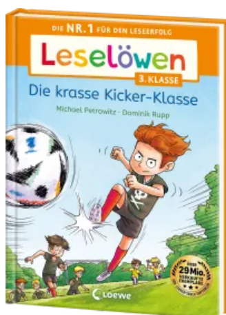
Reading Lions (Year 3) The Toughest Kicker-Class Hardcover