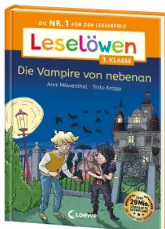
Reading Lions (Year 3) – The Vampires Next Door Hardcover