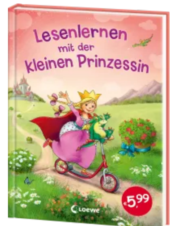
Learning to Read with Princess Sophie Hardcover