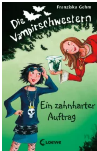
The Vampire Sisters - A Difficult Mission (Vol. 3) Hardcover