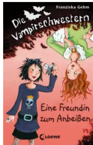
The Vampire Sisters - A Delicious Girl Friend (Vol. 1) Hardcover