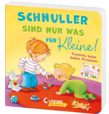
Dummies are Just For Babies! Hardcover