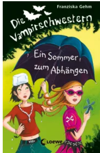
The Vampire Sisters - A Summer for Hanging Out (Vol. 9) Hardcover