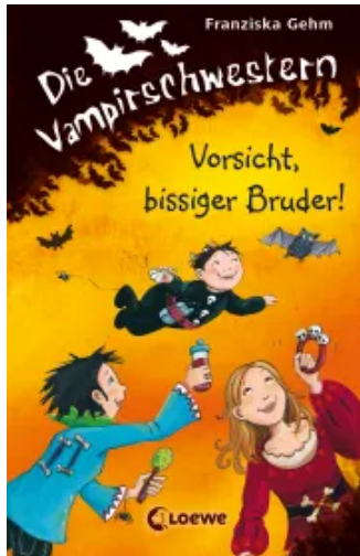
The Vampire Sisters - Beware – Brother Bites! (Vol. 11) Hardcover