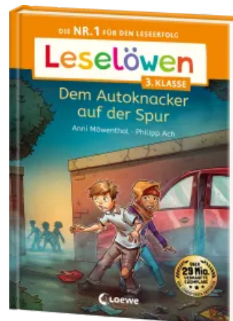
Reading Lions (Year 3) - On the Trail of the Car Burglar Hardcover