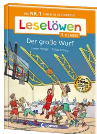
Reading Lions (Year 3) The Big Score Hardcover