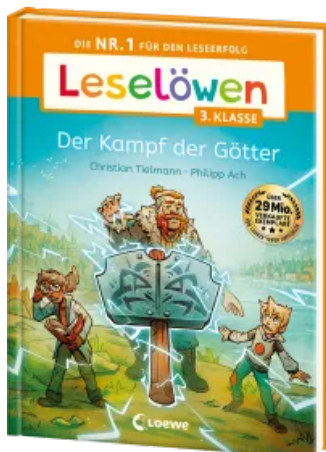
Reading Lions (Year 3) – The Battle of Gods Hardcover