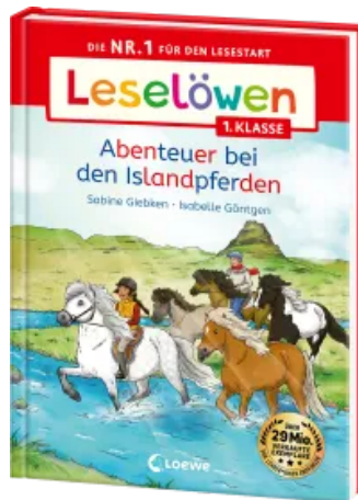
Reading Lions (Year 1) Adventures with the Icelandic Horses Hardcover