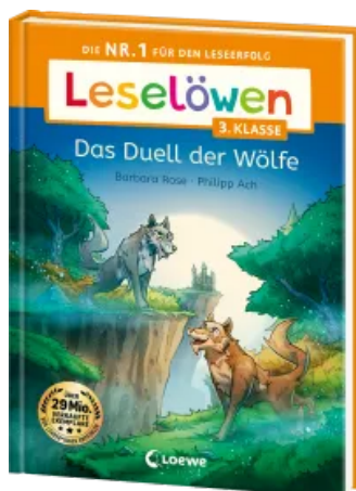
Reading Lions (Year 3) The Duell of the Wolves Hardcover