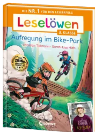
Reading Lions (Year 3) – Excitement In the Bike Park Hardcover