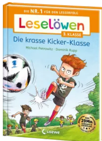
Reading Lions (Year 3) The Toughest Kicker-Class Hardcover