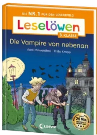
Reading Lions (Year 3) – The Vampires Next Door Hardcover