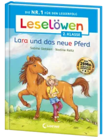
Reading Lions (Year 2) – Lara and the New Horse Hardcover