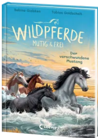
Wild Horses – Brave and Free (Vol. 4) The Missing Mustang Hardcover