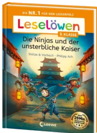
Reading Lions (Year 3) - The Ninjas and the Immortal Emperor Hardcover