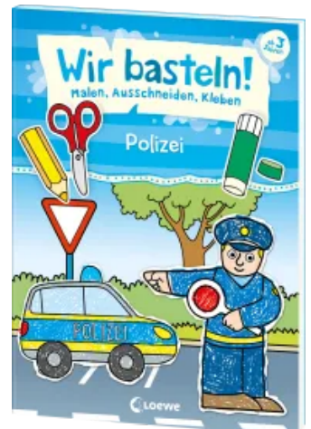
Let's Do Arts & Crafts! 5+ - Painting, Cutting out, Gluing Police Paperback