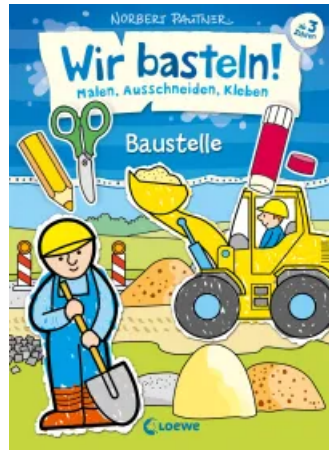
Let's Do Arts & Crafts! 5+ - Painting, Cutting out, Gluing Construction Site Paperback