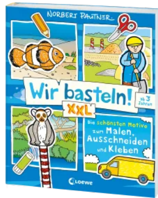
Let's Do Arts & Crafts! XXL - The most beautiful designs to paint, cut out and glue (blue) Paperback