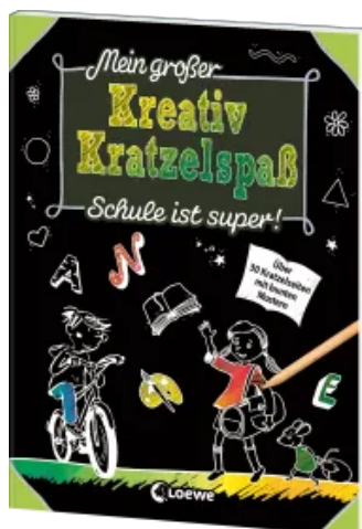
Creative Scratching Fun - School Paperback