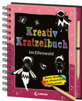
Creative Scratch Book - In the Fairy Forest Hardcover