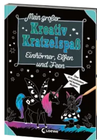
Creative Scratching Fun - Unicorns and Fairies Paperback