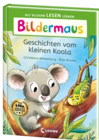
Picture Mouse Tales of the Little Koala Hardcover