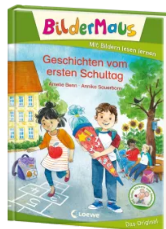
Stories from the First Day of School Hardcover