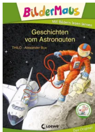
Picture Mouse - Stories About Astronauts Hardcover