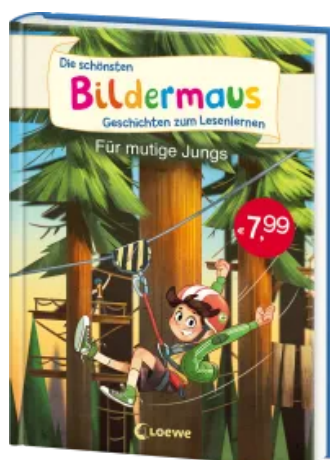
Stories for Learning to Read – For Brave Boys Hardcover