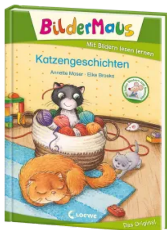
PictureMouse - Cat Stories Hardcover

Picture Mouse - Stories of the Dragon's Castle detail.variantLabels.