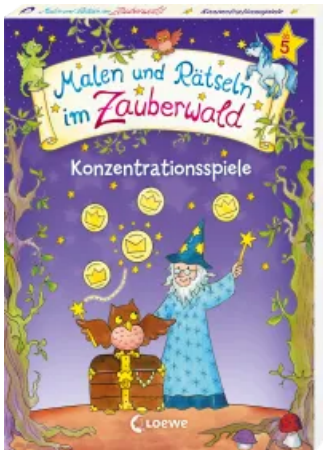
Drawing and Quiz-Solving in the Enchanted Forest - Concentration Paperback