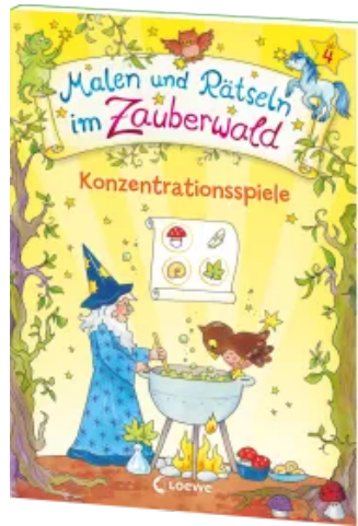
Drawing and Puzzle-solving in the Enchanted Forest - Concentration Games Paperback