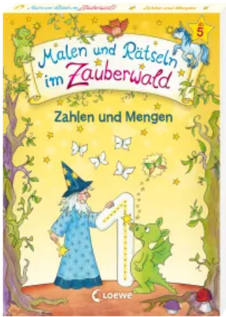
Drawing and Quiz-Solving in the Enchanted Forest - Numbers and Quantities Paperback