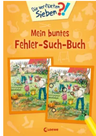
MY COLOURFUL BOOK OF FINDING MISTAKES Paperback