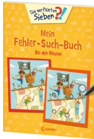
MY BOOK OF FINDING MISTAKES - Pirates Paperback