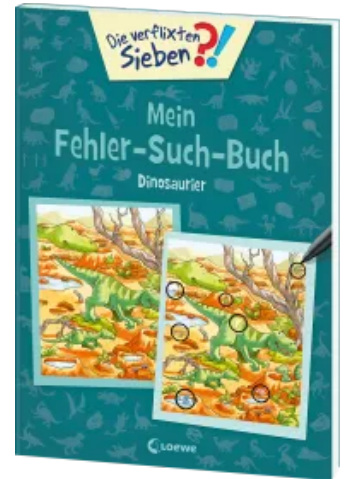
MY BOOK OF FINDING MISTAKES - Dinosaurs Paperback