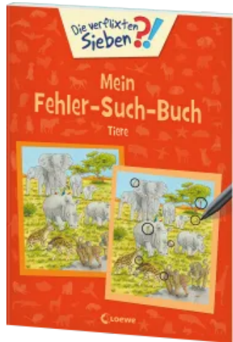
MY BOOK OF FINDING MISTAKES - Animals Paperback