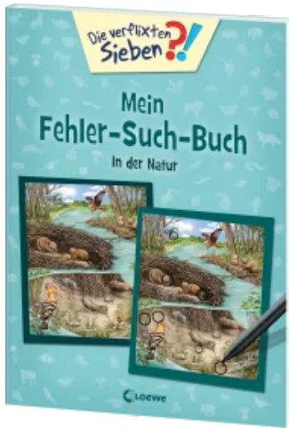
MY BOOK OF FINDING MISTAKES - Nature Paperback