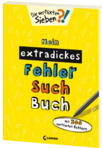
Mein extradickes Fehler- Such-Buch (gelb) Paperback