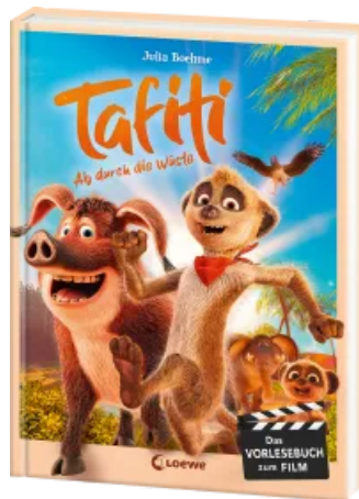
Tafiti Across the Desert Hardcover