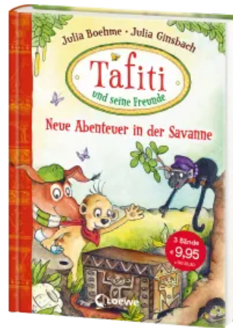
Tafiti and His Friends - New Adventures in the Savannah (Vol. 4-6) Hardcover