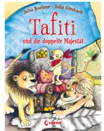
Tafiti and the Rival Kings (Vol. 9) Hardcover