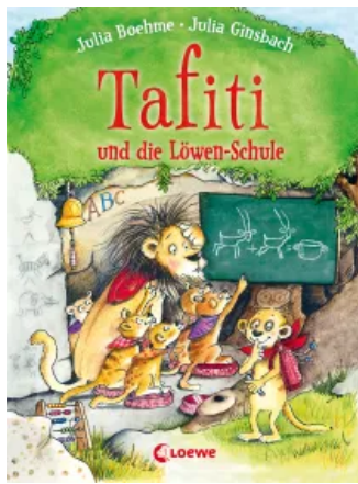
Tafiti and the School of Lions (Vol. 12) Hardcover