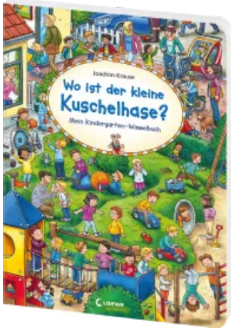
Where Is ... The Little Cuddly Bunny? Hardcover