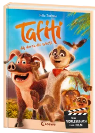
Tafiti Across the Desert Hardcover