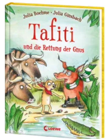
Tafiti and the Rescue of the Gnus (Vol. 16) Hardcover