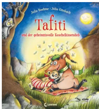
Tafiti and the Mysterious Cushion Thief