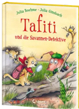
Tafiti and the Savannah Detectives (Vol. 13)