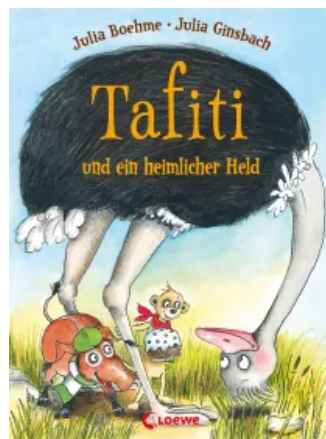
Tafiti and a Secret Hero (Vol. 5)