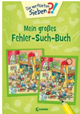
MY BIG BOOK OF FINDING MISTAKES Paperback