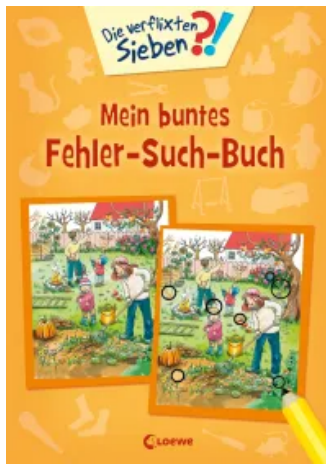
MY COLOURFUL BOOK OF FINDING MISTAKES Paperback