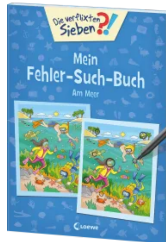
MY BOOK OF FINDING MISTAKES - At the Sea Paperback