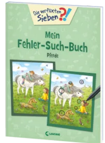
MY BOOK OF FINDING MISTAKES - Horses Paperback