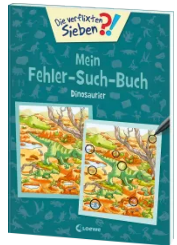
MY BOOK OF FINDING MISTAKES - Dinosaurs Paperback