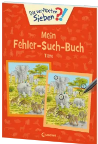
MY BOOK OF FINDING MISTAKES - Animals Paperback