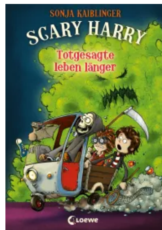
Scary Harry – The Reported Dead Live Longer (Vol. 2) Hardcover