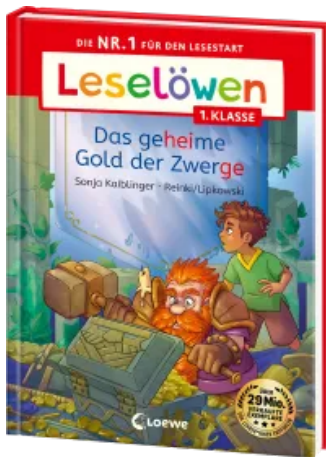
Reading Lions (Year 1) The Secret Gold of the Dwarfs Hardcover