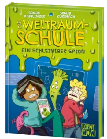
Space School – Slimy Spion (Vol. 2) Hardcover