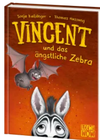
Vincent - and the Scared Zebra (Vol. 3) Hardcover