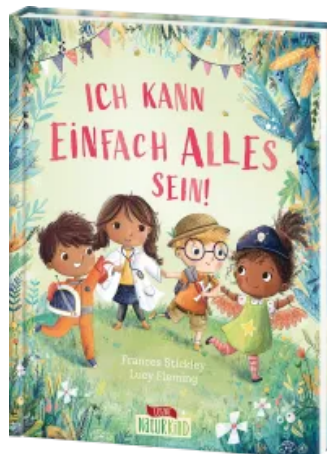
Ich kann einfach alles sein! Hardcover