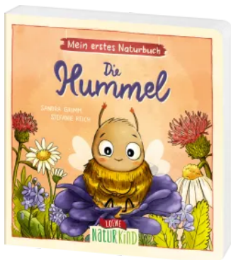
My First Naturebook – The Bumblebee Hardcover