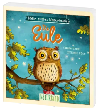
My First Naturebook – The Owl Hardcover