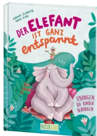
Nonchalant like an Elephant – Calming Exercises for Children Hardcover