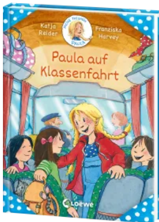
My Best Friend Paula - School Trip! Hardcover