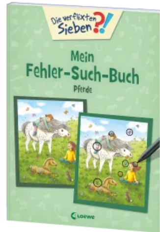
MY BOOK OF FINDING MISTAKES - Horses Paperback