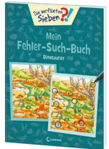
MY BOOK OF FINDING MISTAKES - Dinosaurs Paperback