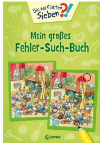
MY BIG BOOK OF FINDING MISTAKES Paperback