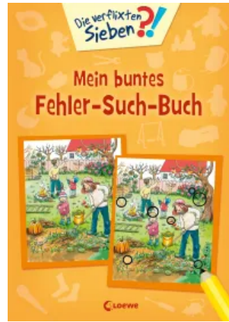
MY COLOURFUL BOOK OF FINDING MISTAKES Paperback