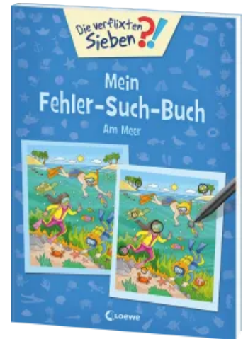
MY BOOK OF FINDING MISTAKES - At the Sea Paperback