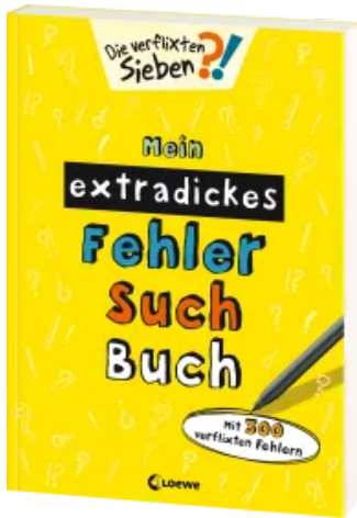
Mein extradickes Fehler-Such-Buch (gelb) Paperback