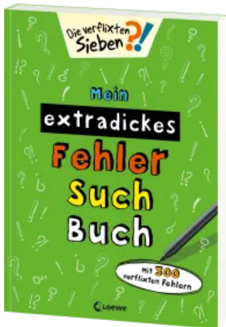
MY BIG BOOK OF FINDING MISTAKES - Green Paperback