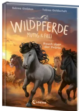
Wild Horses: Brave and Free (Vol. 5) – Smoke over the Prairie Hardcover