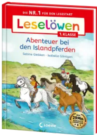
Reading Lions (Year 1) Adventures with the Icelandic Horses Hardcover