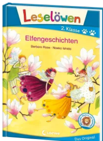
Fairy Stories Hardcover