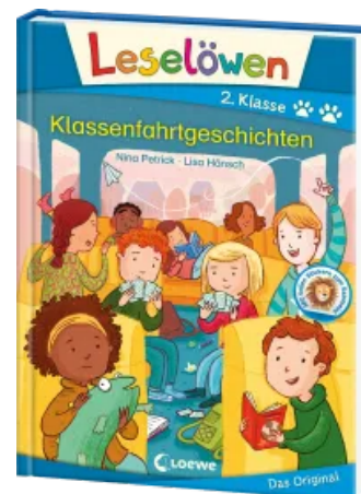
School Trip Stories Hardcover