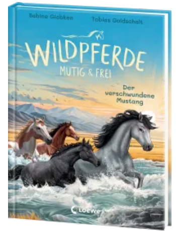
Wild Horses – Brave and Free (Vol. 4) The Missing Mustang Hardcover