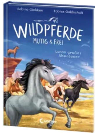
Wild Horses – Brave and Free (Vol. 1) Luna, the Moon Whisperer Hardcover