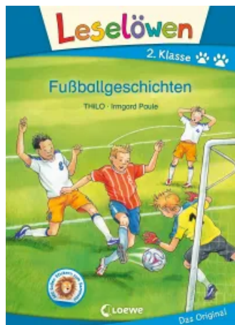
Football Stories Hardcover