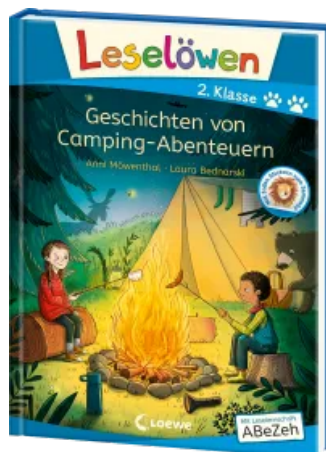
Reading Lions Year 2 - Camping Adventure Stories Hardcover