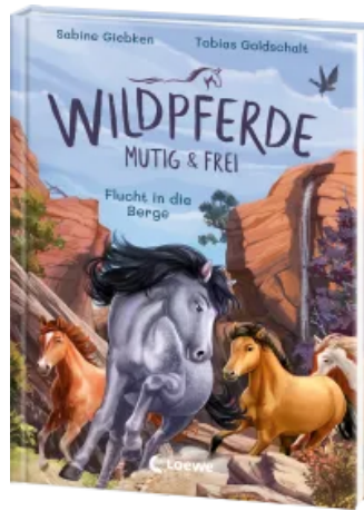
Wild Horses – Brave and Free (Vol. 3) Escape to the Mountains Hardcover