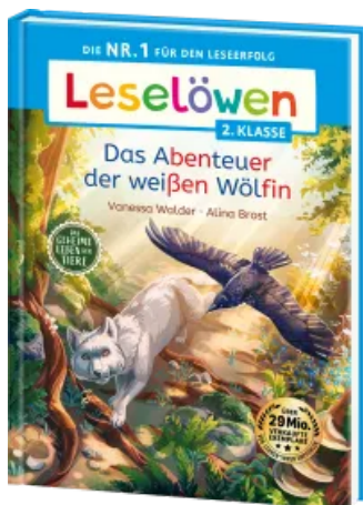
Reading Lions (Year 2) - The Adventure of the White Wolf Hardcover