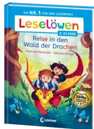
Reading Lions (Year 2) - Journey to the Forest of Dragons Hardcover