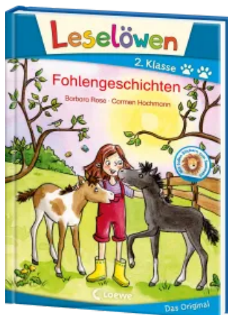
Foal Stories Hardcover