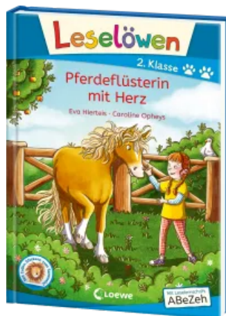
Reading Lions Year 2 - Horse Whisperer With Heart Hardcover