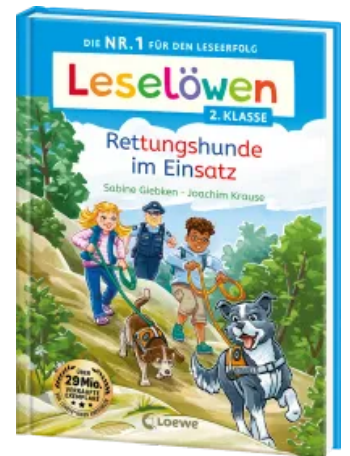
Reading Lions (Year 2) Rescue Dogs in Action Hardcover