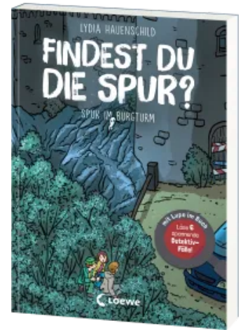
Can You Find the Clue? - Haunting the Castle Tower Paperback

Picture Mouse, Reading Dictionary detail.variantLabels.