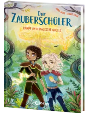
The Sorcerer's Apprentice (Vol. 4) Battle for the Magic Spring Hardcover