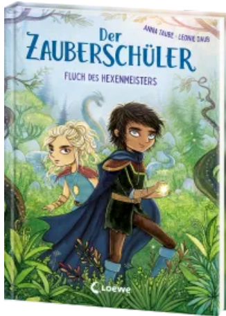
The Sorcerer's Apprentice (Vol. 1) The Teacher's Curse Hardcover