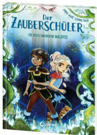
The Sorcerer's Apprentice (Vol. 7) The Missing Forest Fairy Hardcover