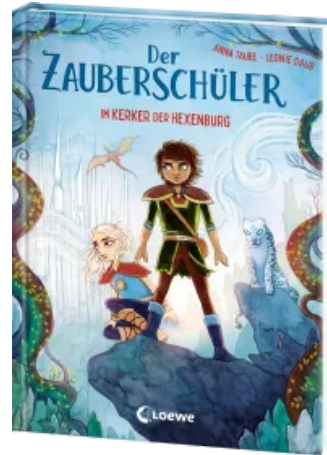
The Sorcerer's Apprentice (Vol. 5) In the Witch Castle's Dungeon Hardcover