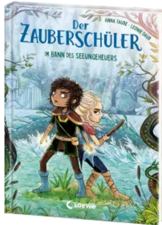
The Sorcerer's Apprentice (Vol. 2) Under the Spell of the Sea Monster Hardcover