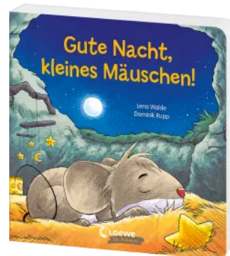
Good Night, Little Mouse! Hardcover