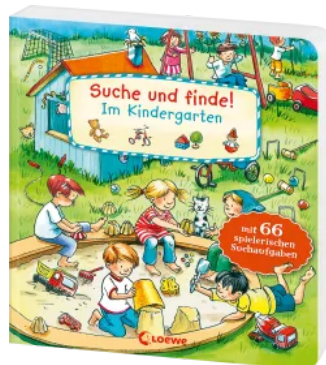
Search and Find! – In Kindergarten Hardcover