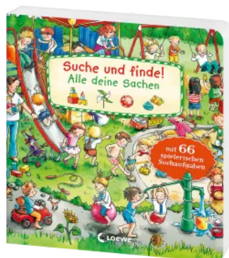
Search and Find! – Favourite Items Hardcover