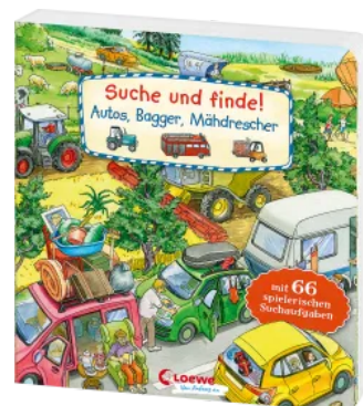
Search and Find! – Cars, Diggers, Harvesters Hardcover