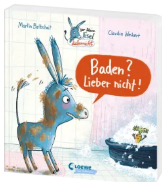
Little Donkey No-Never- Ever - Taking a Bath Hardcover