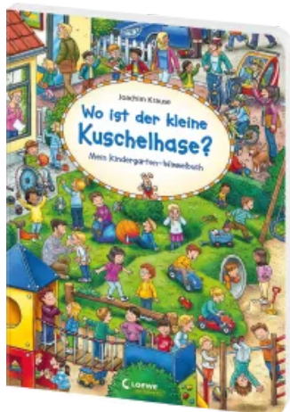
Where Is ... The Little Cuddly Bunny? Hardcover