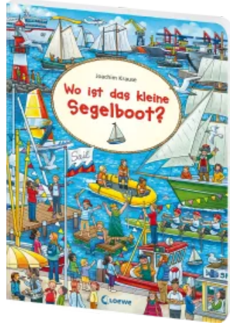
Where the the Little Sailboat? Hardcover

Where is the Little Drill? detail.variantLabels.