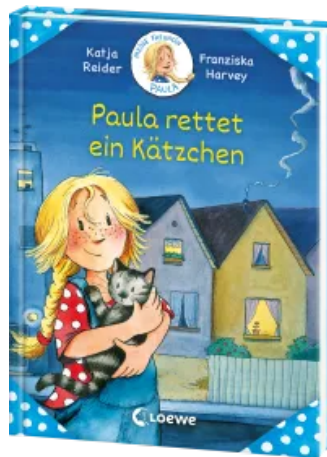
My Best Friend Paula - Kitty in Danger! Hardcover