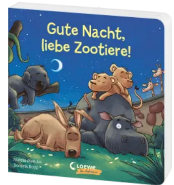
Good Night, Dear Zoo Animals! Hardcover