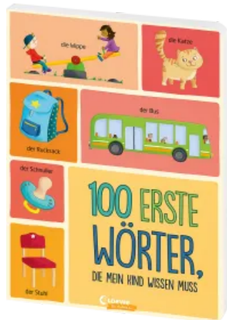
100 First Words My Child Needs To Know Hardcover