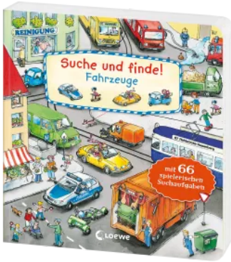
Search and Find! – Vehicles Hardcover