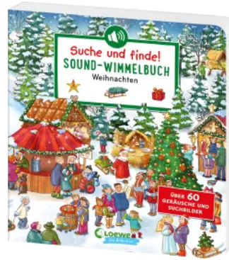
Search and Find! Sound- Book Christmas Hardcover