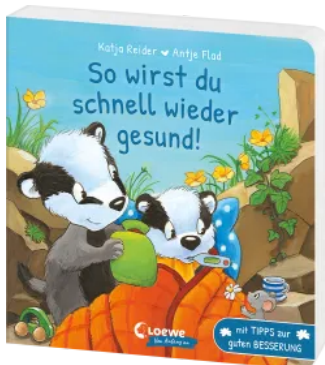
How to Get Well Again Quickly! With Tips for a Good Recovery Hardcover