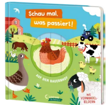
Schau mal, was passiert! Auf dem Bauernhof Hardcover