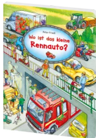
Where Is ... The Little Racing Car? Hardcover