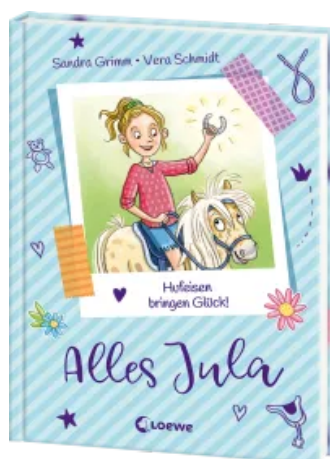
Jula Got It – Horseshoes Stand for Luck! (Vol. 3) Hardcover