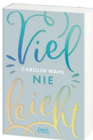
Maybe Never Paperback