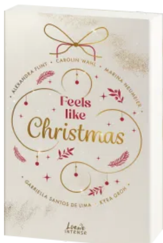
Feels Like Christmas Paperback