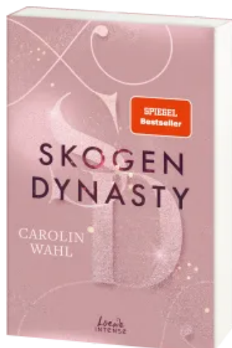
Crumbling Hearts (Vol.1) - Skogen Dynasty Paperback