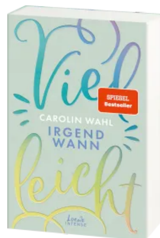
Maybe Someday Paperback