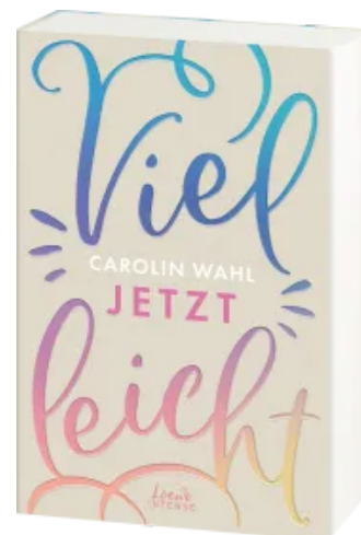
Maybe Now Paperback