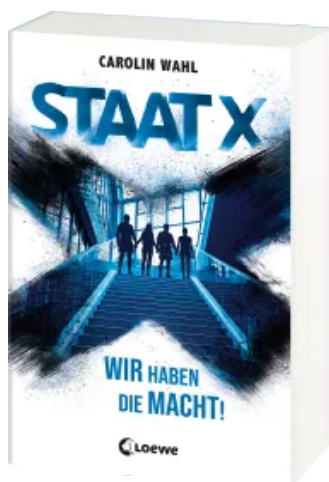
Nation X - We have the Power! Paperback