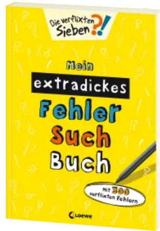
Mein extradickes Fehler- Such-Buch (gelb) Paperback