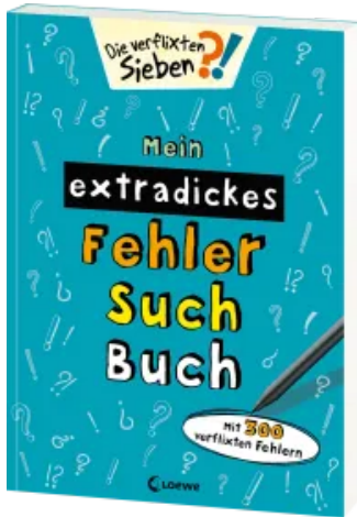
MY BIG BOOK OF FINDING MISTAKES - Petrol Paperback