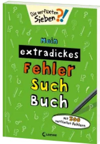
MY BIG BOOK OF FINDING MISTAKES - Green Paperback