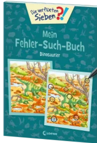
MY BOOK OF FINDING MISTAKES - Dinosaurs Paperback