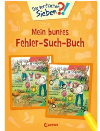
MY COLOURFUL BOOK OF FINDING MISTAKES Paperback