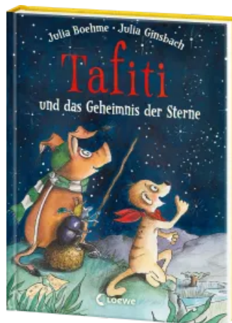
Tafiti and the Secret of the Stars (Vol. 14) Hardcover

Leo & Lolli - A Pony Needs Friends! (Vol. 1) detail.variantLabels.