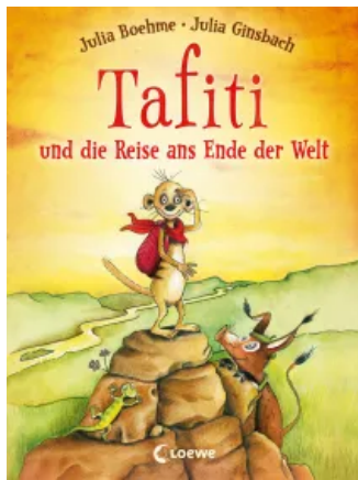
Tafiti and the Journey to the End of the World (Vol. 1) Hardcover