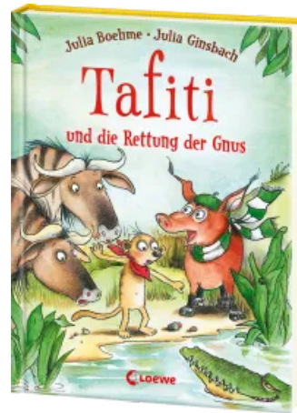
Tafiti and the Rescue of the Gnus (Vol. 16)