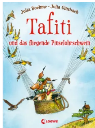
Tafiti and the Flying Red River Hog (Vol. 2) Hardcover