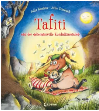
Tafiti and the Mysterious Cushion Thief