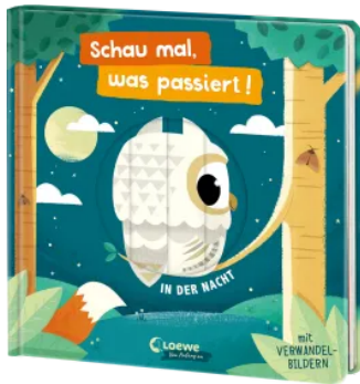
Schau mal, was passiert! In der Nacht Hardcover