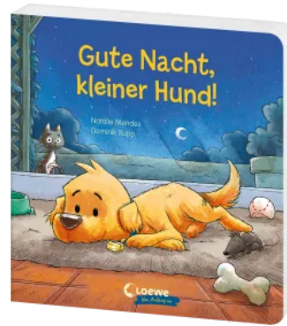
Good Night, Little Dog! Hardcover