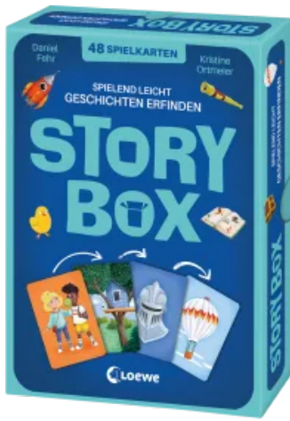
Story Box – Inventing Stories with Ease Special Edition