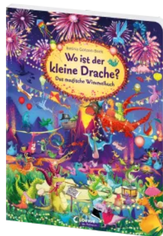
The Magical Hidden Object Book – Where is the Little Dragon? Hardcover