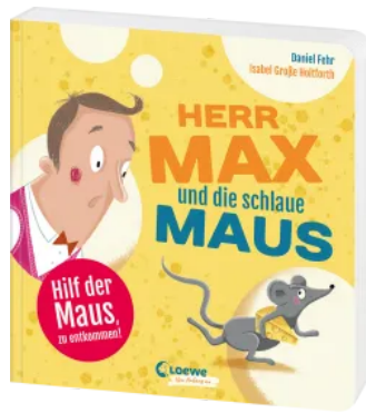
Mr. Max and the Clever Mouse Hardcover