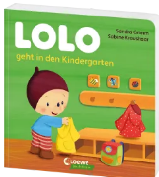
Lolo in Kindergarten Hardcover