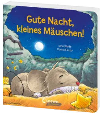
Good Night, Little Mouse! Hardcover