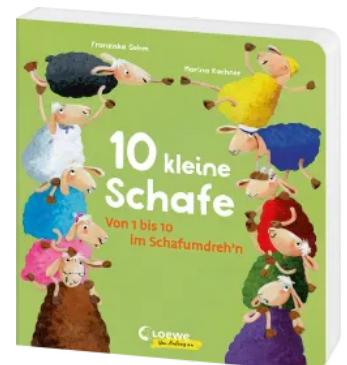
10 Little Sheep Hardcover