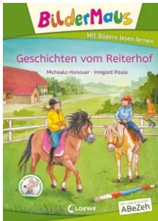
BilderMaus - Riding School Stories Hardcover