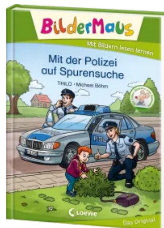
PictureMouse - Tracking Evidence with the Police Hardcover