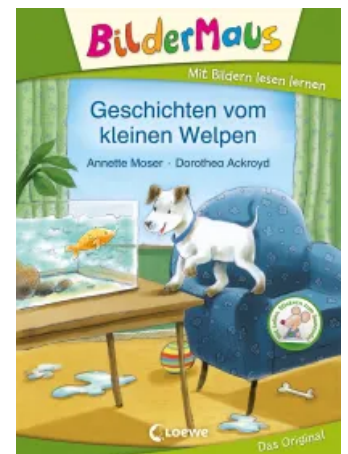
Tales of the Little Puppy Hardcover