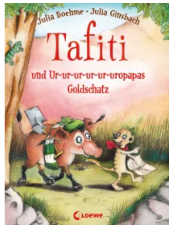
Tafiti and Great-great- great-great-great-great- grandpapa's Gold Treasure (Vol. 4) Hardcover

Learning with Tafiti – Using Numbers from 1 to 20 Paperback