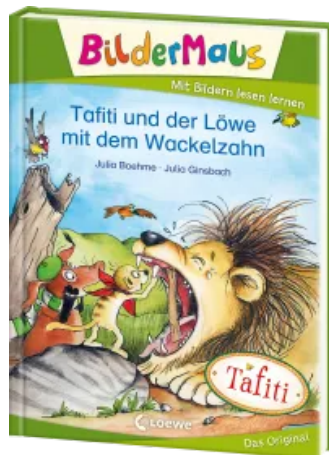
PictureMouse - Tafiti and the Lion with the Wobbly Tooth Hardcover

Learning with Tafiti – Counting from 1 to 10 Paperback