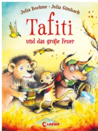
Tafiti and the Great Fire (Vol. 8) Hardcover