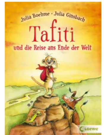
Tafiti und die Reise ans Ende der Welt (Band 1) Special Edition

Learning with Tafiti – Counting from 1 to 10 Paperback