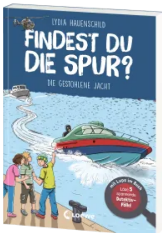
Can You Find the Clue? - The Stolen Yacht Paperback