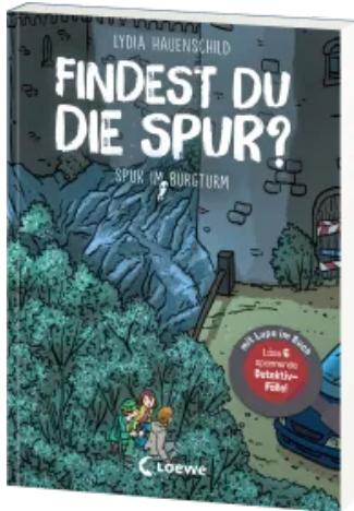
Can You Find the Clue? - Haunting the Castle Tower Paperback