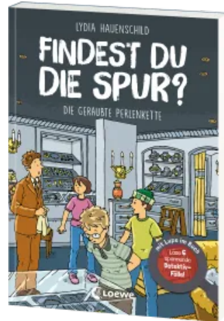
Can You Find the Clue? - The Stolen Pearl-Necklace Paperback