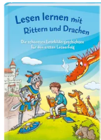
Learning to Read With Knights and Dragons detail.variantLabels.