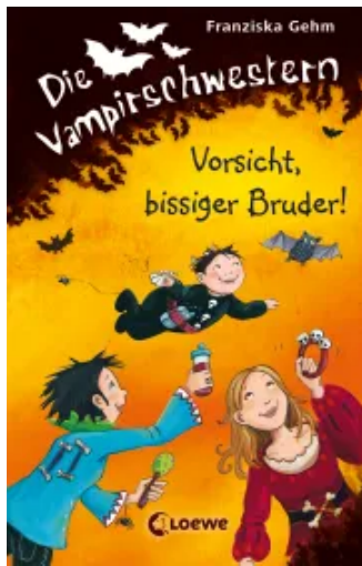
The Vampire Sisters - Beware – Brother Bites! (Vol. 11) Hardcover