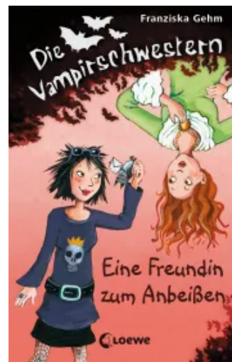
The Vampire Sisters - A Delicious Girl Friend (Vol. 1) Hardcover

A Pink Day for the Little Princess detail.variantLabels.