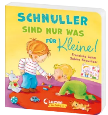
Dummies are Just For Babies! Hardcover