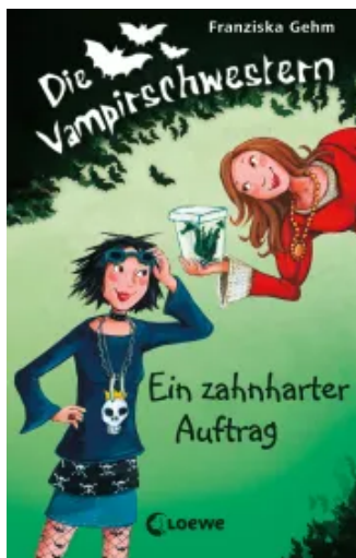
The Vampire Sisters - A Difficult Mission (Vol. 3) Hardcover

A Pink Day for the Little Princess detail.variantLabels.