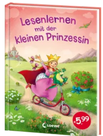
Learning to Read with Princess Sophie Hardcover