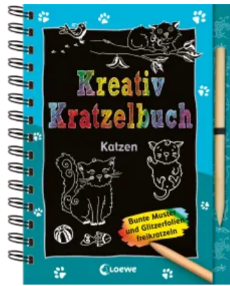
Creative Scratch Book - Cats Hardcover