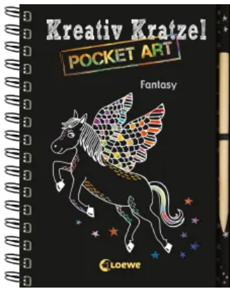
Creative Scratch Pocket Art: Fantasy Hardcover