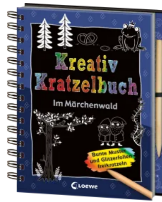
Creative Scratching - Tales' Forest Hardcover