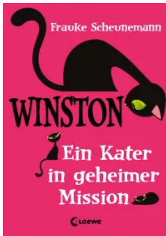
Winston – A Cat on a Secret Mission (Vol. 1) Hardcover