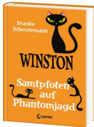
Winston - Velvet Paws on a Phantom Hunt (Vol. 7) Hardcover