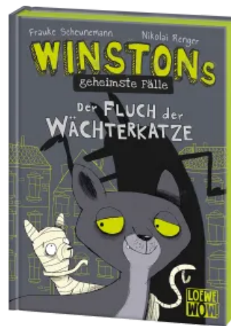
WINSTON's Cold Cases – The Curse of the Watch Cat (Vol. 1) Hardcover