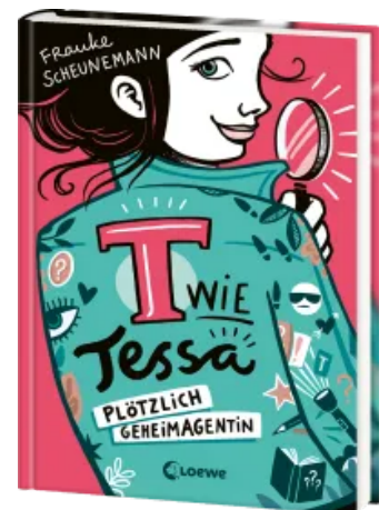
T for Tessa - Secret Agent by Surprise (Vol. 1) Hardcover