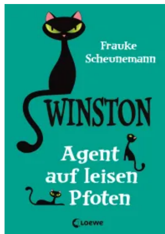
Winston – Agent on Silent Paws (Vol. 2) Hardcover