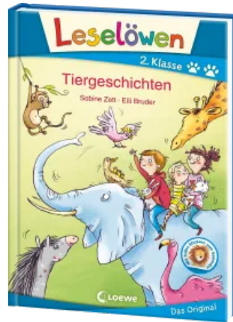
Animal Stories Hardcover