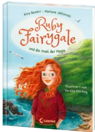
Ruby Fairygale And the Island of Magic (Vol. 1) Hardcover

Reading Pirates - Stories About Cats Hardcover