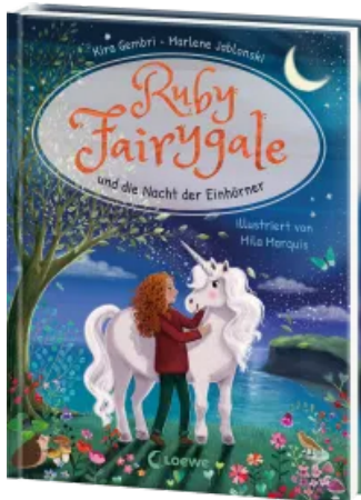
Ruby Fairygale And the Night of the Unicorns (Vol. 4) Hardcover