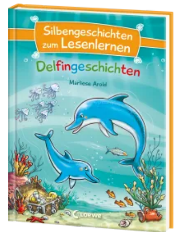
Syllable Stories for Learning to Read - Dolphin Stories Hardcover