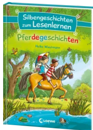
Syllable Stories for Learning to Read - Horse Stories Hardcover