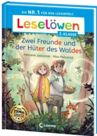
Reading Lions (Year 2) Two Friends and the Guardian of the Forest Hardcover