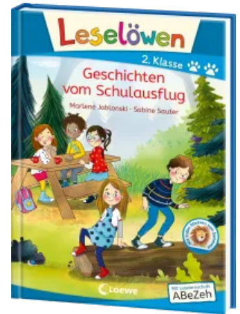
Reading Lions Year 2 - Stories from Class Trip Hardcover

Reading Pirates - Stories About Cats Hardcover