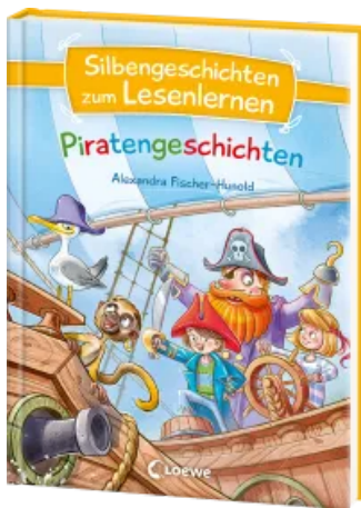
Syllable Stories for Learning to Read - Pirate Stories Hardcover