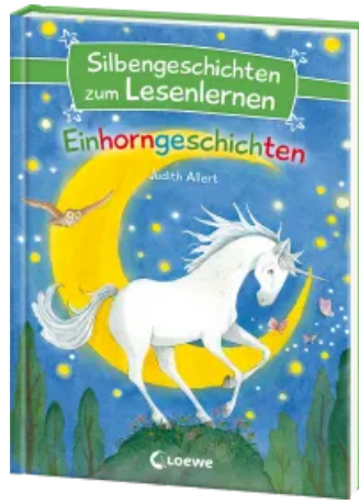
Syllable Stories for Learning to Read - Unicorn Stories Hardcover