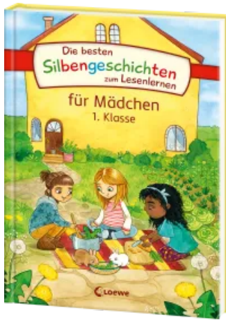
Syllable Stories for Girls - 1st Grade Hardcover