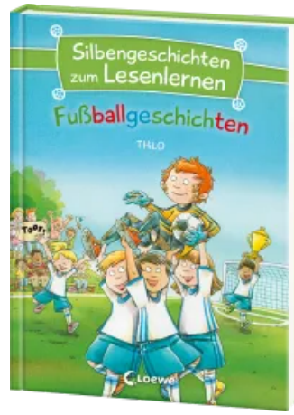
Syllable Stories for Learning to Read - Football Stories Hardcover