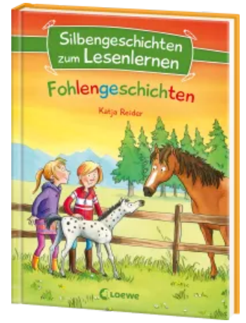
Syllable Stories for Learning to Read - Foal Stories Hardcover