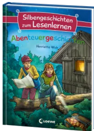
Syllable Stories for Learning to Read - Adventure Stories Hardcover