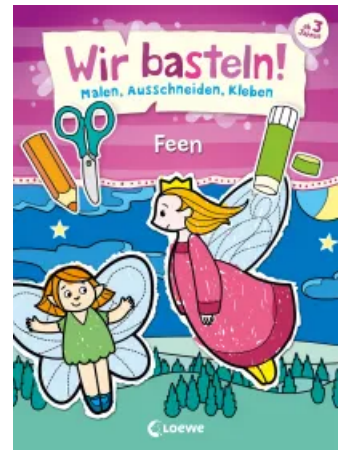
Let's Do Arts & Crafts! 5+ - Painting, Cutting out, Gluing Fairies Paperback