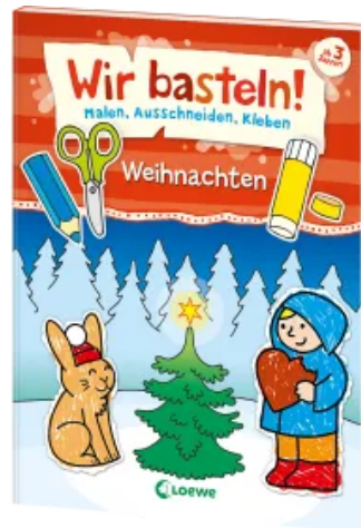
Let's Do Arts & Crafts! - Christmas Paperback