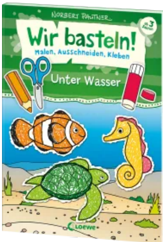
Let's Do Arts & Crafts! 5+ - Painting, Cutting out, Gluing Under Water Paperback