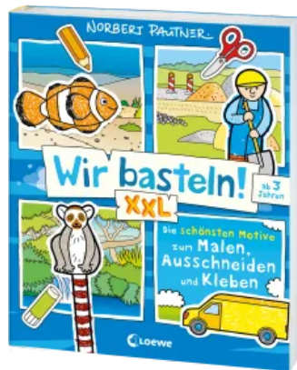
Let's Do Arts & Crafts! XXL - The most beautiful designs to paint, cut out and glue (blue) Paperback