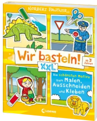
Let's do Arts and Crafts! XXL - The most beautiful designs to paint, cut out and glue (yellow) Paperback