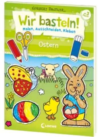
Let's Do Arts and Crafts! - Easter Paperback