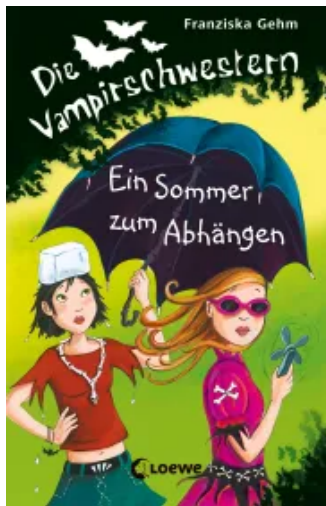
The Vampire Sisters - A Summer for Hanging Out (Vol. 9) Hardcover