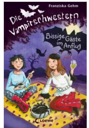
The Vampire Sisters - Snappish Guests Approaching (Vol. 6) Hardcover