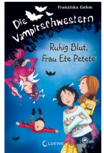
The Vampire Sisters - Keep Your Hair On, Mrs Niminy Piminy (Vol. 12) Hardcover