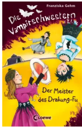
The Vampire Sisters - The Master of Dragon-Fu (Vol. 7) Hardcover