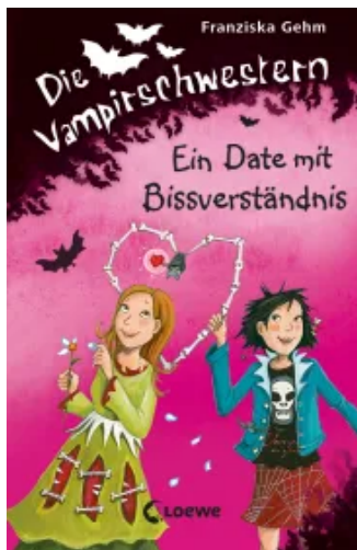
The Vampire Sisters - A Date With a Nibbly Feel (Vol. 10) Hardcover