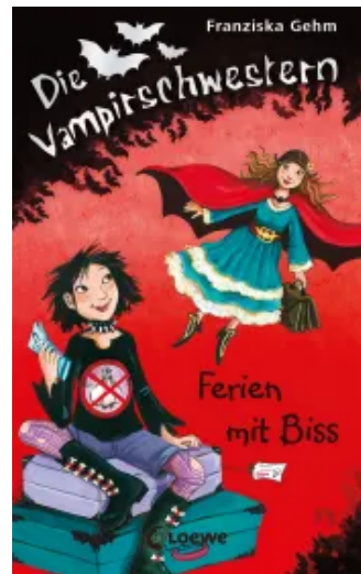
The Vampire Sisters - A Biting Vacation (Vol. 5) Hardcover