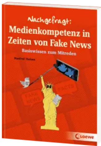
A Guide to Media Literacy in Times of Fake News Paperback