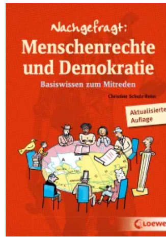
Guide to Human Rights and Democracy Paperback