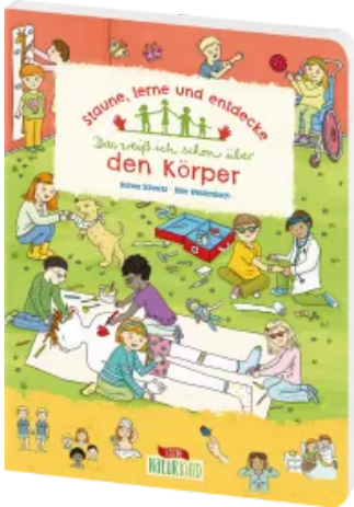
Wonder, Learn and Discover - All I Know About My Body Hardcover