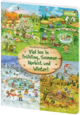
Let's Go Explore the Seasons! Hardcover