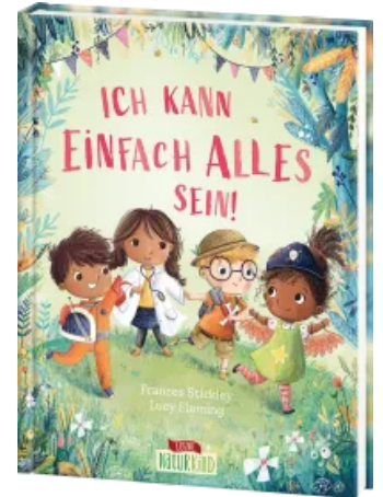
Ich kann einfach alles sein! Hardcover