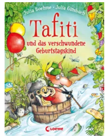
Tafiti and the Missing Birthday Kid (Vol. 10) Hardcover