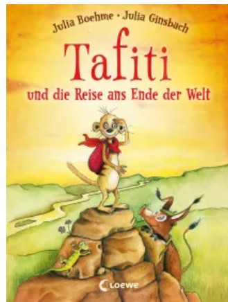
Tafiti and the Journey to the End of the World (Vol. 1) Hardcover