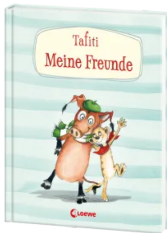
My Friends - Tafiti Hardcover