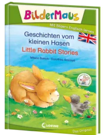
Picture Mouse English - Little Rabbit Stories Hardcover