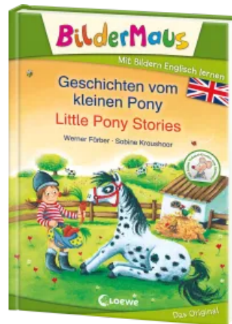
Picture Mouse English - Little Pony Stories Hardcover