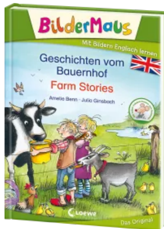
Picture Mouse English - Farm Stories Hardcover