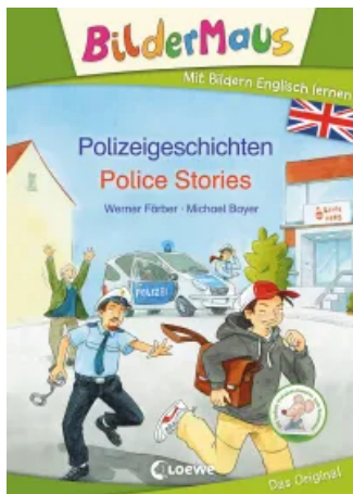
Picture Mouse English - Police Stories Hardcover