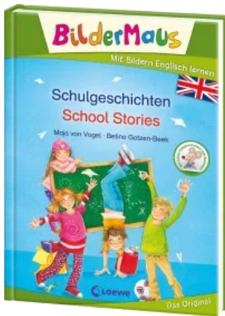
PictureMouse English - School Stories Hardcover