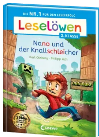
Reading Lions (Year 2) Nano and the Creeper Hardcover