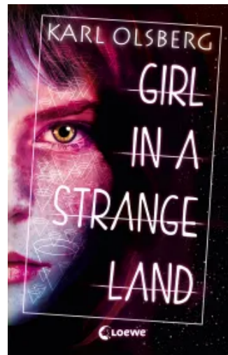
Girl in a Strange Land Paperback