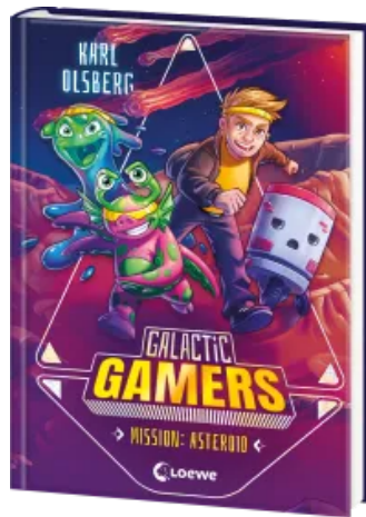
Galactic Gamers – Mission: Asteroid (Vol. 2) Hardcover