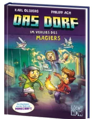
The Villagers (Vol.7) In the Wizard's Dungeon Hardcover