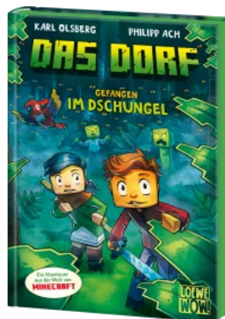
The Villagers (Vol. 3) Trapped in the Jungle Hardcover