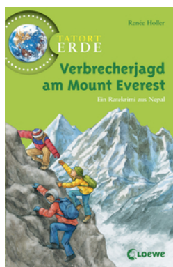
Global Mysteries – Hunting Criminals At the Foot of Mount Everest