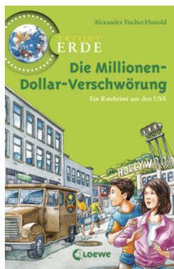
Global Mysteries – The Million Dollar Conspiracy