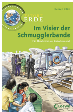
Global Mysteries – Caught By The Smugglers