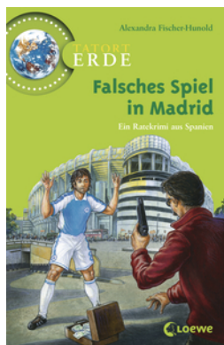
Global Mysteries – Foul Game in Madrid