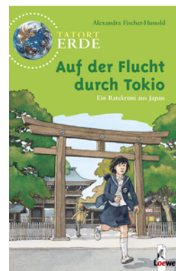
Global Mysteries – Chased through Tokyo