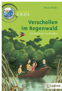
Global Mysteries – A Disappearance in the Rain Forest