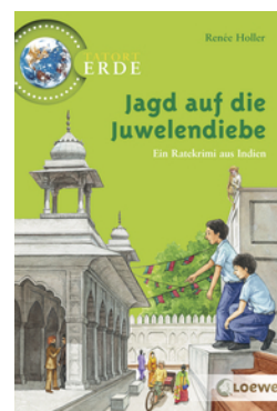
Global Mysteries – The Hunt for the Jewel Thieves