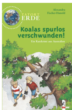
Global Mysteries – The Mystery of the Disappearing Koalas