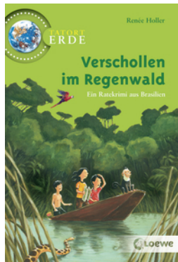
Global Mysteries – A Disappearance in the Rain Forest