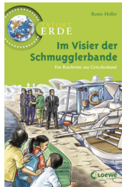
Global Mysteries – Caught By The Smugglers