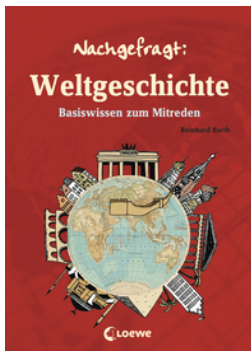
Guide to World History