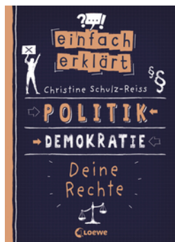
Simply Explained – Politics, Democracy, Your Rights