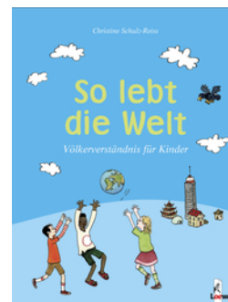
How The World Lives