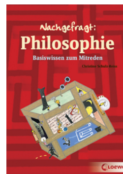
Guide to Philosophy