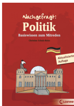
Guide to Politics