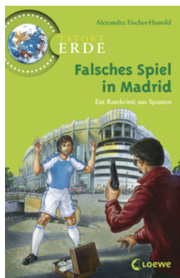
Global Mysteries – Foul Game in Madrid