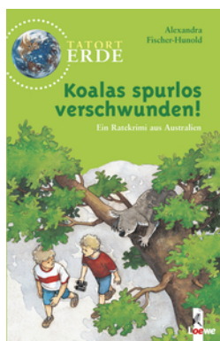
Global Mysteries – The Mystery of the Disappearing Koalas